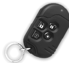
Figure 1. MCT-234

Each transmitter is supplied with a small key ring.