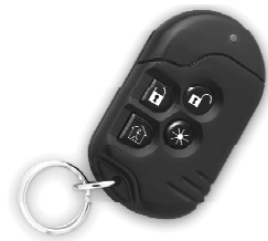
Figure 1. MCT-234

Each transmitter is supplied with a small key ring.